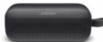
BOSE SOUNDLINK FLEX BLUETOOTH® SPEAKER

Winners will be announced January 27th, 2022.