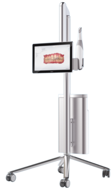
3SHAPE TRIOS® INTRAORAL SCANNER

3Shape TRIOS Intraoral Scanner | Wireless Scanning | Digital Solutions. (n.d.). Retrieved September 20, 2022, from https://www.straumann.com/digital/us/en/home/equipment/io-scanners/3shape-trios.html